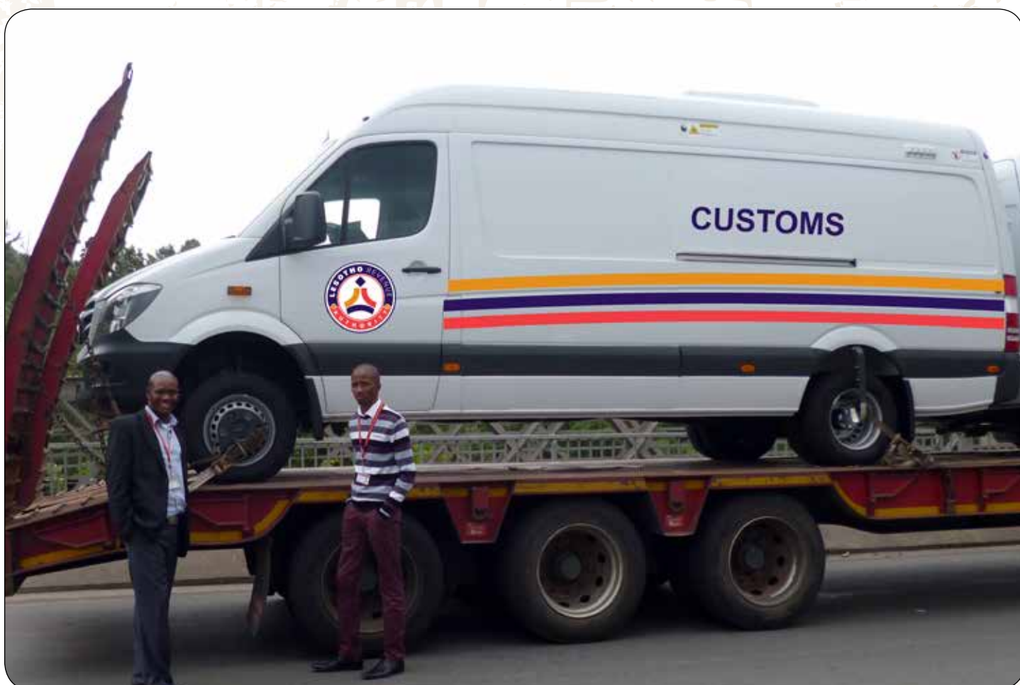
LRA officers posing for a photo in front of the new Compact Mobile Scanners

The scanners will allow Customs to perform checks on vehicles without physically opening the vehicle thus improving speed and efficiency of the processes.