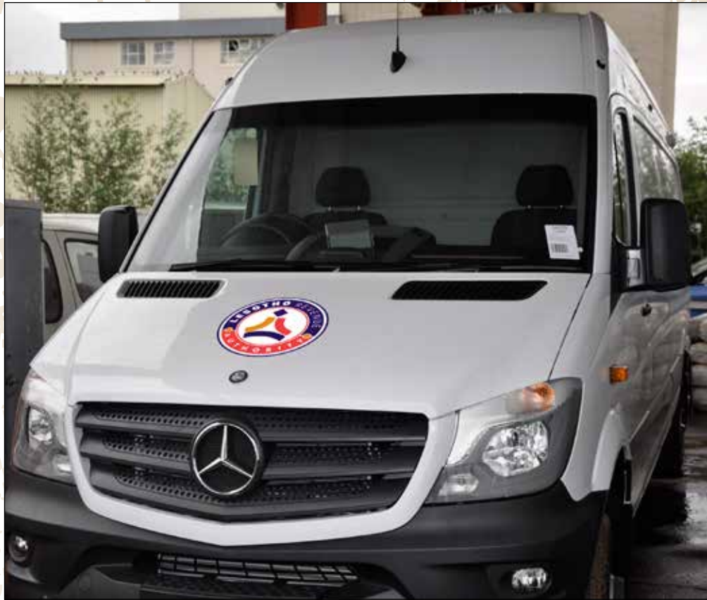
The new acquired Compact Mobile scanner

the traders. Quick and spot-on inspections will reduce queues and waiting time for traders.