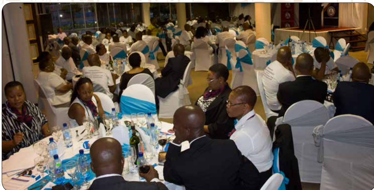
Participants of the World Customs Day Celebration

There was also presentation of awards to selected traders and partners as part of the day's celebrations. Other members of HOBA were also in attendance. World Customs Day is an annual event.