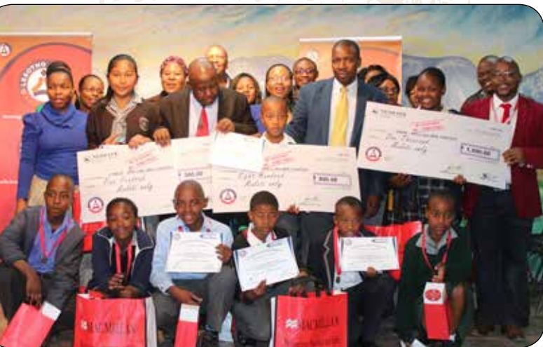
The winners of Spelling Bee contest pose for a photo

N ational University of Lesotho International School (NULIS) scooped first prize in the inaugural Lesotho Revenue Authority (LRA) Spelling Bee Contest held in Maseru recently. The runners up were New Millennium Primary School while Maseru Preparatory School (Maseru Prep) came third.