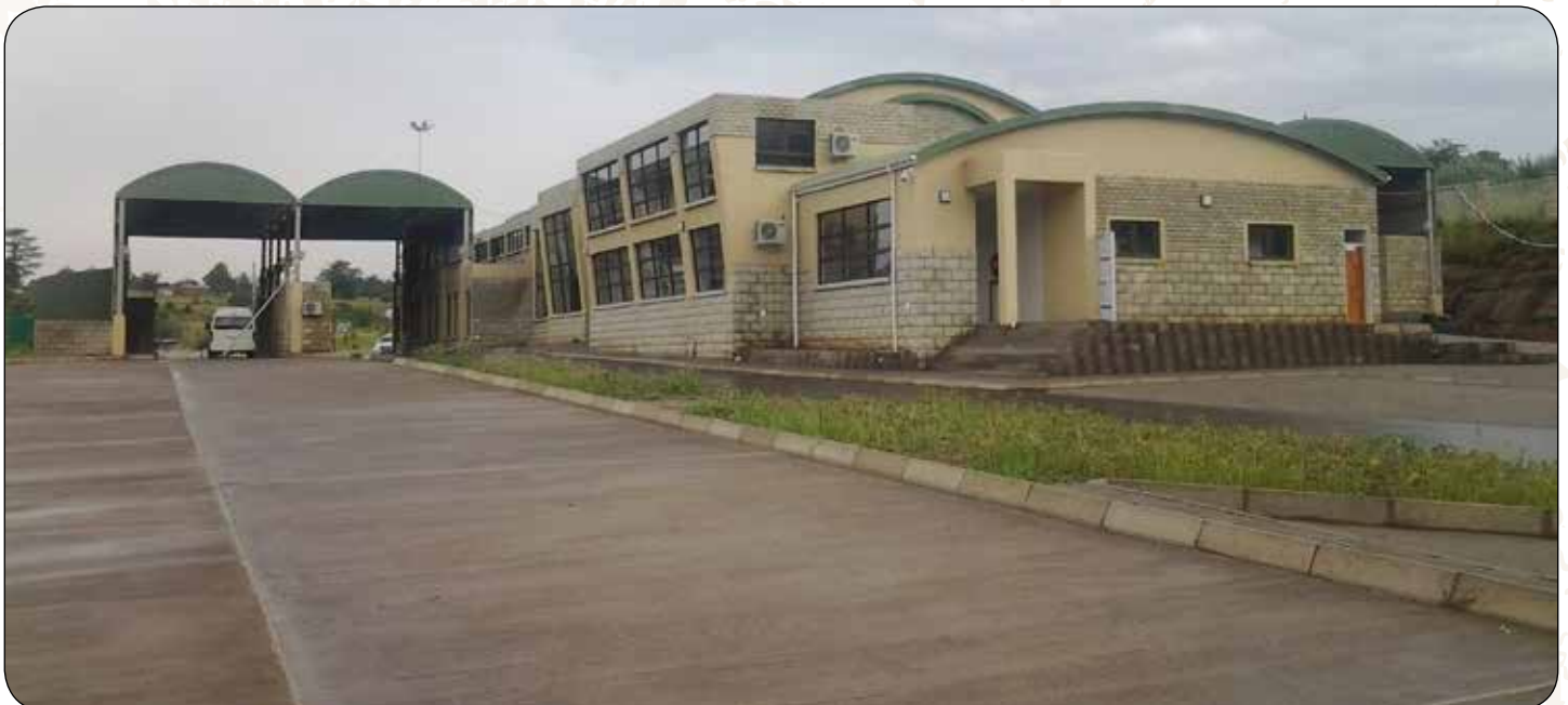
The newly constructed Caledonspoort Border Post

The refurbishment of the Caledonspoort Border Post forms part of the efforts by the LRA to provide improved border infrastructure that can facilitate easy movement of goods at ports of entry. The Border Refurbishment Project started with the refurbishment of Maputsoe Bridge followed by Maseru Bridge then Tele Bridge.