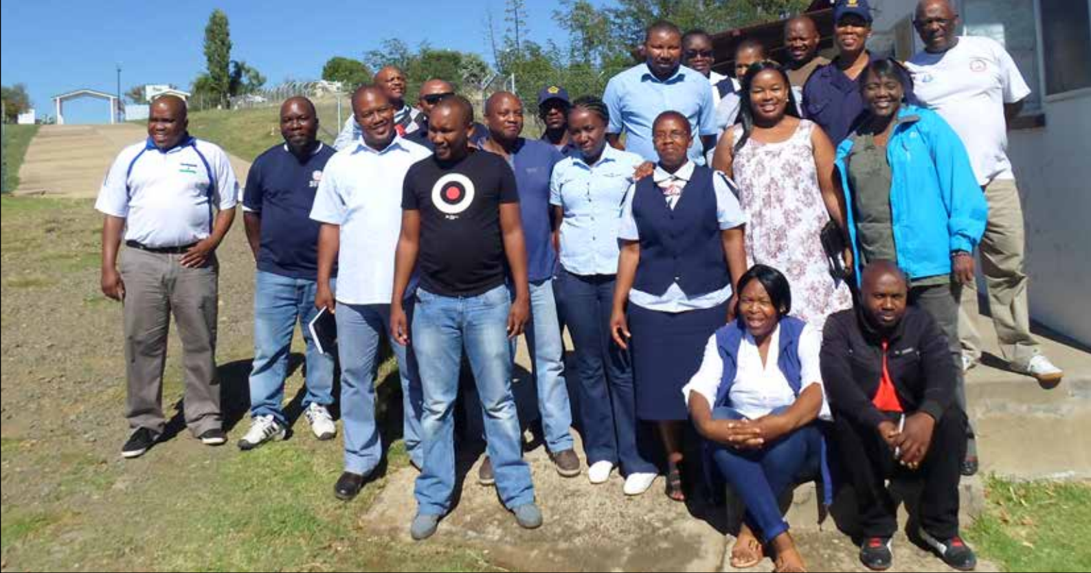
HOBA members visit to Makhaleng border post