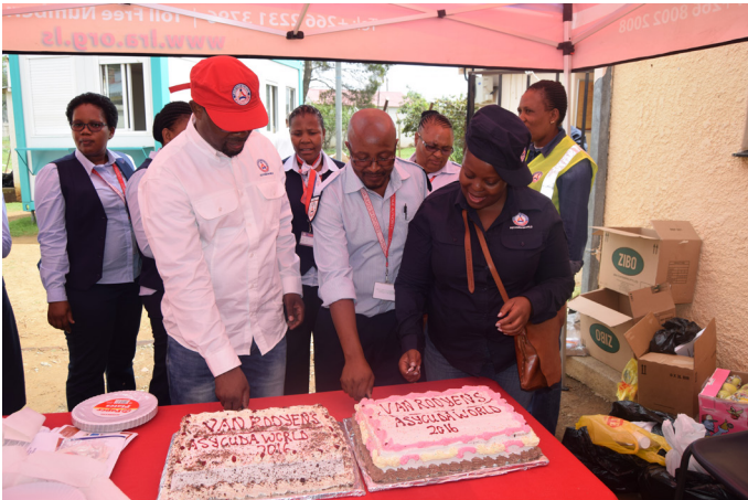
Van Rooyens gate Rollout in Pictures