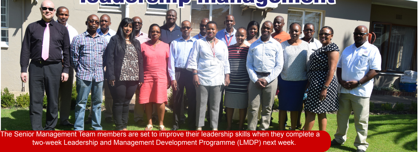
The Senior Management Team members are set to improve their leadership skills when they complete a two-week Leadership and Management Development Programme (LMDP) next week.

The Lesotho Revenue Authority (LRA) hosted the World Customs Organization Senior Management Leadership and Management Development Programme from 1st - 12th February 2016. The workshop concept was based on the WCO Leadership and Management Development (LMD) content which ensures congruence in terms of management language, strategic prioritization and ultimately organizational culture.