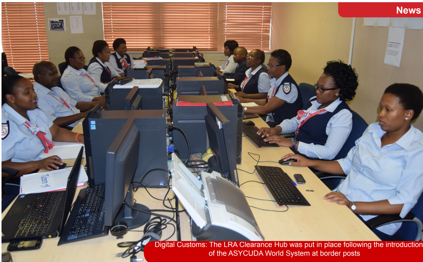
Digital Customs: The LRA Clearance Hub was put in place following the introduction of the ASYCUDA World System at border posts