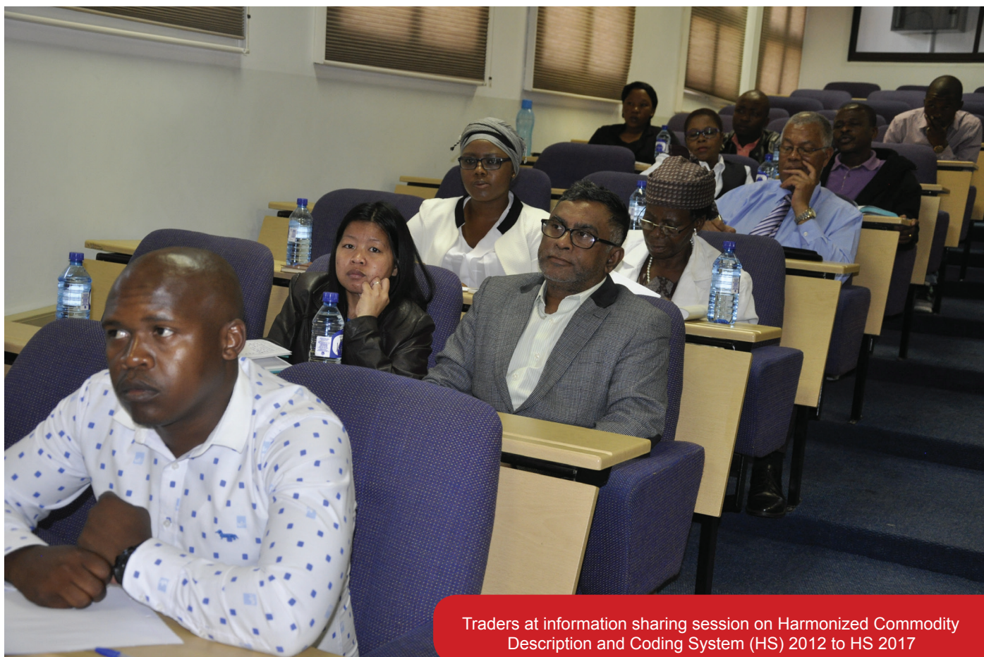
Traders at information sharing session on Harmonized Commodity Description and Coding System (HS) 2012 to HS 2017