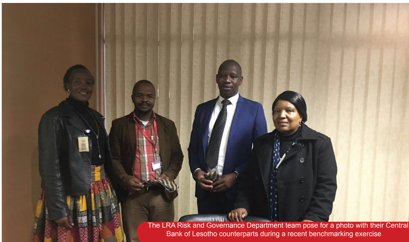
The LRA Risk and Governance Department team pose for a photo with their Central Bank of Lesotho counterparts during a recent benchmarking exercise

W ith the increasing number of natural disasters around the globe, the importance of business continuity management is becoming more apparent. The recent attacks of natural disasters have highlighted the importance of system availability forcing the senior management of many organizations to have contingency planning on the forefront of their minds. While business continuity issues do not always arise on a daily basis, it is important to prepare for the day a disaster strikes.