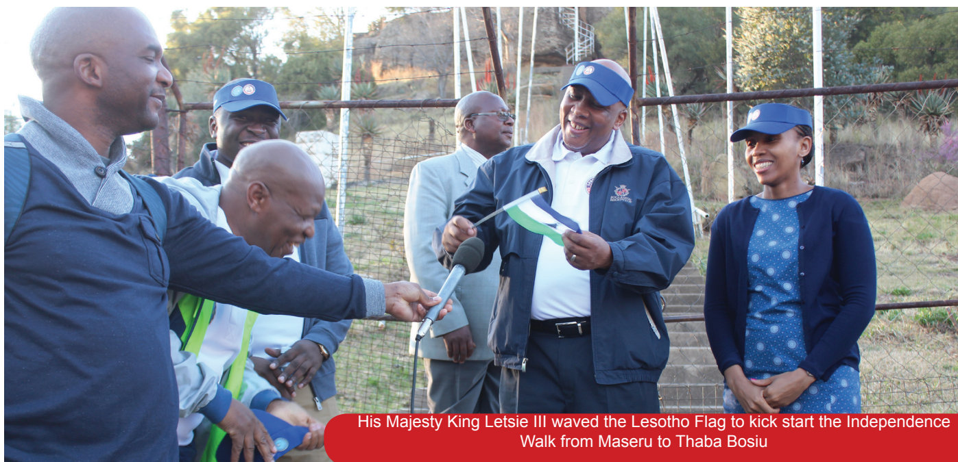
His Majesty King Letsie III waved the Lesotho Flag to kick start the Independence Walk from Maseru to Thaba Bosiu

T he Lesotho Revenue Authority (LRA) joint the rest of the country in celebrating the Lesotho's 50th Independence Celebrations by supporting the Independence Walk from Maseru to Thaba Bosiu last Saturday, 3rd September 2016.