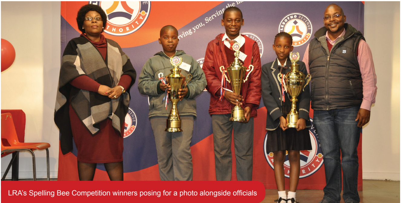
LRA's Spelling Bee Competition winners posing for a photo alongside officials

The Unity English Medium School was crowned as the Champions of the second Lesotho Revenue Authority (LRA) Spelling Bee Competition held at Maseru Preparatory School Hall on Friday, 26th August 2016. The runners up were the SOS Primary School while Montessori International School took the third position. The Khubetsoana based, Unity English Medium School and other runners up were awarded trophies and hampers for their sterling performance.